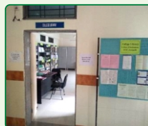
College library (Digital)