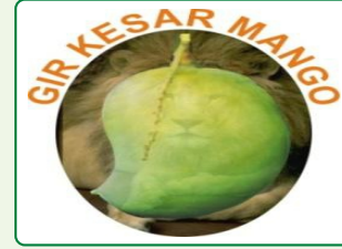
Geographical Indication (GI) for Gir Kesar Mango