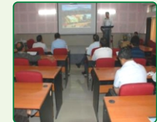
Virtual Class Room